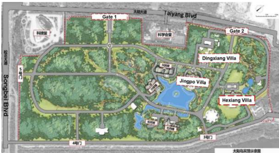
(Map of Harbin Sun Island Hotel)

Hotel address: No. 1 Taiyang Blvd, Songbei District, Harbin, China.